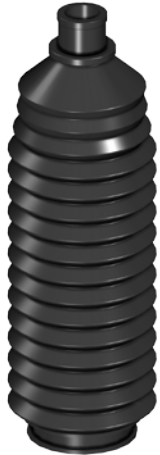
Boot x 2