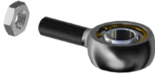
Tie Rod End x 2