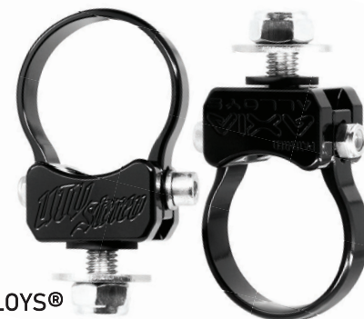
AXIA ALLOYS® HEAVY DUTY CLAMPS x2