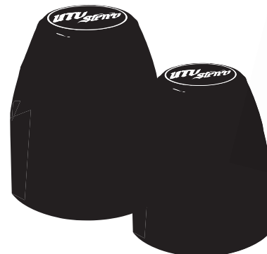
UTV STEREO 6.5" CAGE MOUNT SPEAKER PODS x2