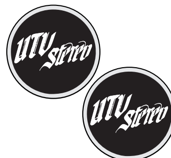
UTV STEREO BRUSHED ALUMINUM SPEAKER BADGES x2